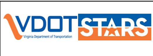
Study Area I-81 Exit-77 and Exit-80 Interchange Improvement Operational Analysis and Safety Study Wythe County, VA