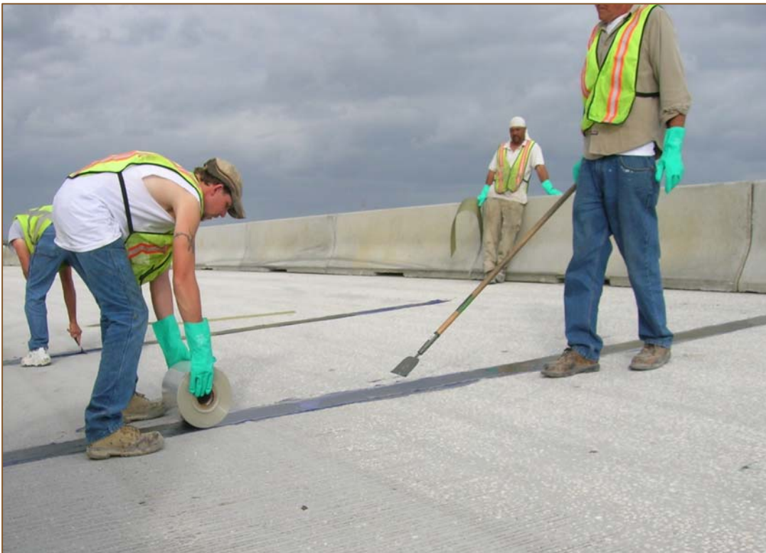
Figure 6 Carbon fiber mesh repair. Epoxy is placed on the deck surface along the crack. The carbon fiber mesh is rolled into the epoxy.