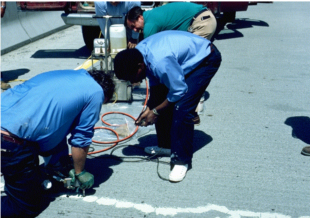
Figure 8 Epoxy injection repair.