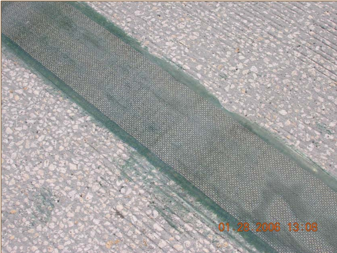
Figure 7 Carbon fiber mesh repair.