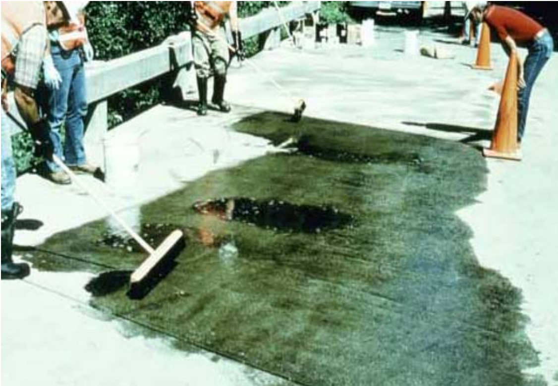
Figure 4 Pattern cracks in a deck being filled with a gravity fill polymer.