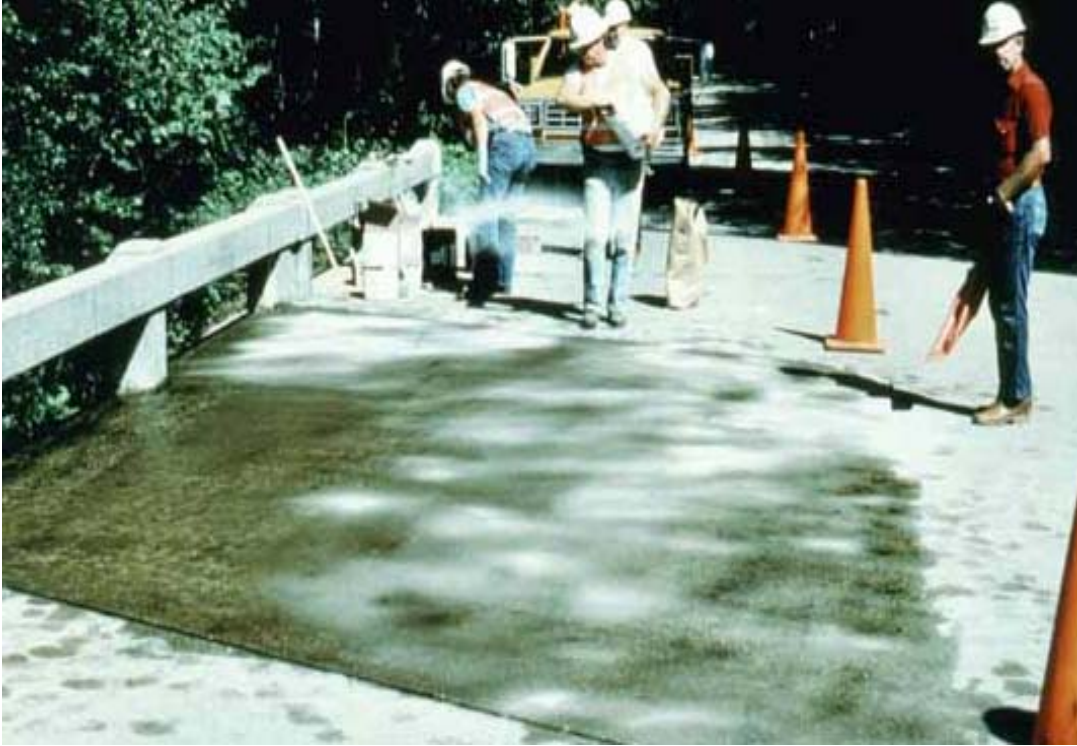
Figure 5 Sand being broadcast into the polymer to provide an acceptable skid number.