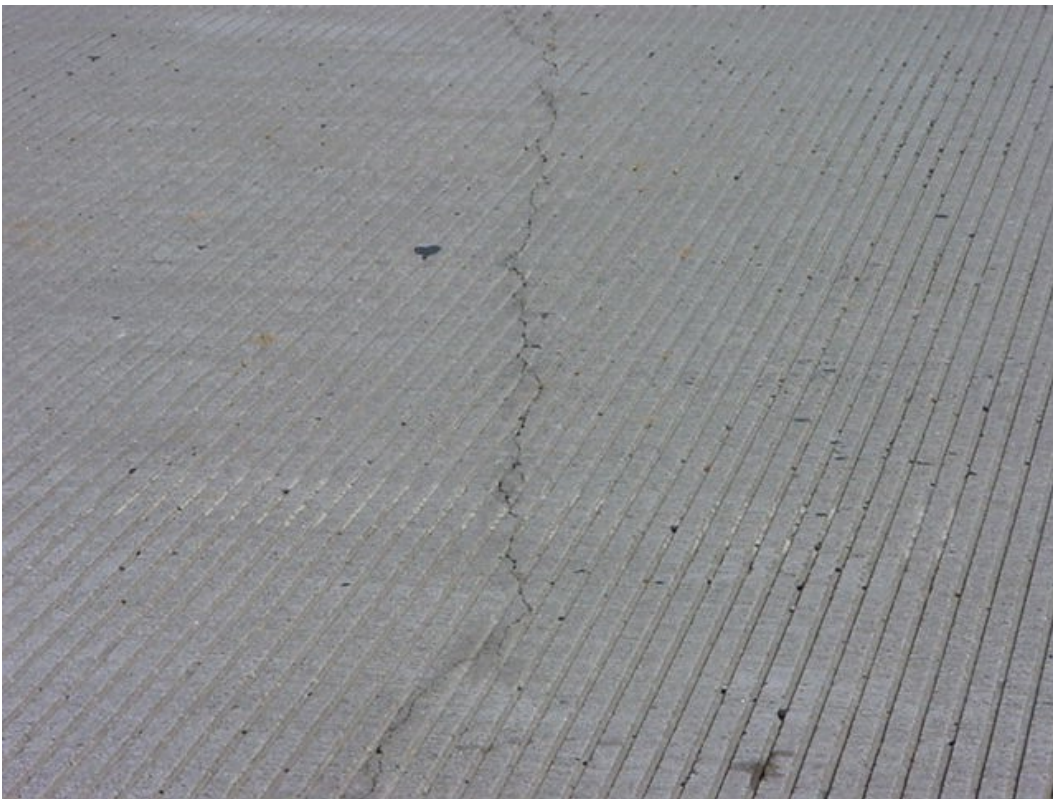
Figure 2 Deck with transverse linear cracks.